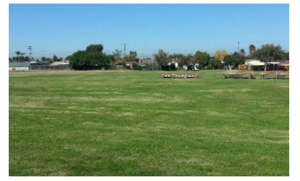
Playing fields need reconditioning.