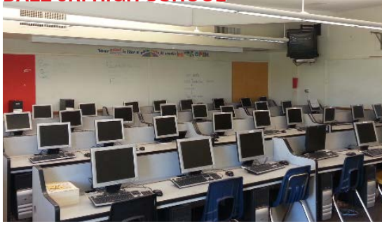
More computer labs needed to meet Common Core.