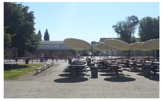
Campus quad needs redesign, shade structures, & stage.