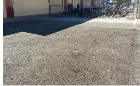
Campus-wide paving is in poor condition.