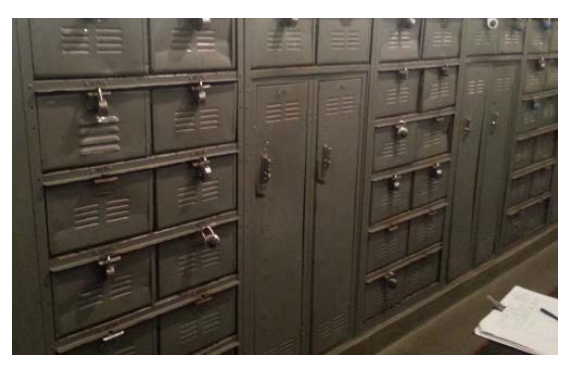
Locker rooms are in need of reconfiguration and additional P.E. lockers.